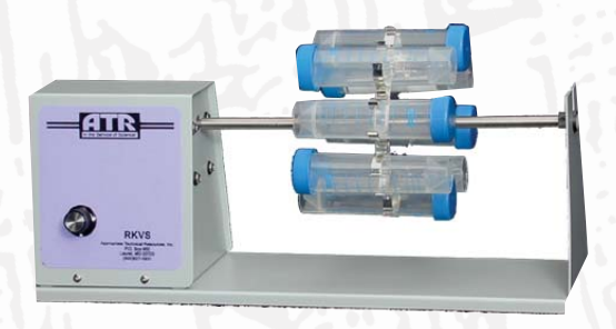
RKVS w/RR-50 Rod