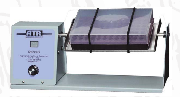
RKVSD w/TT - Rack

The ATR Rotamix offers end over end vertical and horizontal rotations for all types of mixing and extraction protocols. The Rotamix is constructed of chemically resistant, powder coated steel. These units provide quiet operation and maximum flexibility. The interchangeable twelve inch rods accomodate tube sizes from 1.5 to 50 mL. The Rotamix is suitable for use in both cold rooms and incubators to 42° C (room temperature storage of the Rotamix is recommended when not in use). The speed is variable from 15 to 80 rpm.