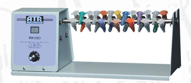
RKVSD w/TT - 1.5 Rod