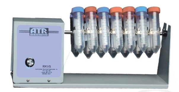
RKVS w/TT - Rod